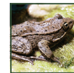
California Red-Legged Frog