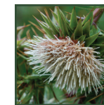
Mt. Hamilton Thistle