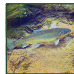
Central California Coast Steelhead