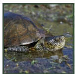
Western Pond Turtle

For more information on the Administrative Draft Habitat Plan, Biological Goals and Objectives, and the Preferred Conservation Strategy, please visit www.scv-habitatplan.org .