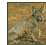
San Joaquin Kit Fox